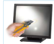
Anti-Reflection Strengthen Glass