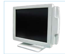
Card Reader Version