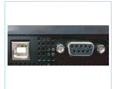
Touch Combo Interface